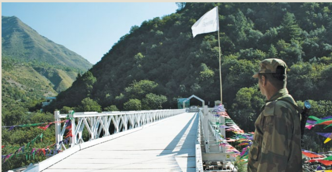
Kaman Aman Setu bridge, built in 2005 by India and Pakistan to facilitate travel and trade between both sides of Kashmir.

In 2015, our work in South Asia continued to ensure relationships among and between communities and the other parties to the conflict are collaborative and constructive, and formal and informal governance structures and processes in conflict-affected areas are more responsive to local priorities. In particular we strengthened our impact with regards to trade across the LoC in Kashmir. As a result, there is increased support among policymakers for the cross-LoC trade process and greater recognition of the Jammu and Kashmir Joint Chamber of Commerce and Industries (JK-JCCI) – Kashmir’s first and only cross-LoC institution.