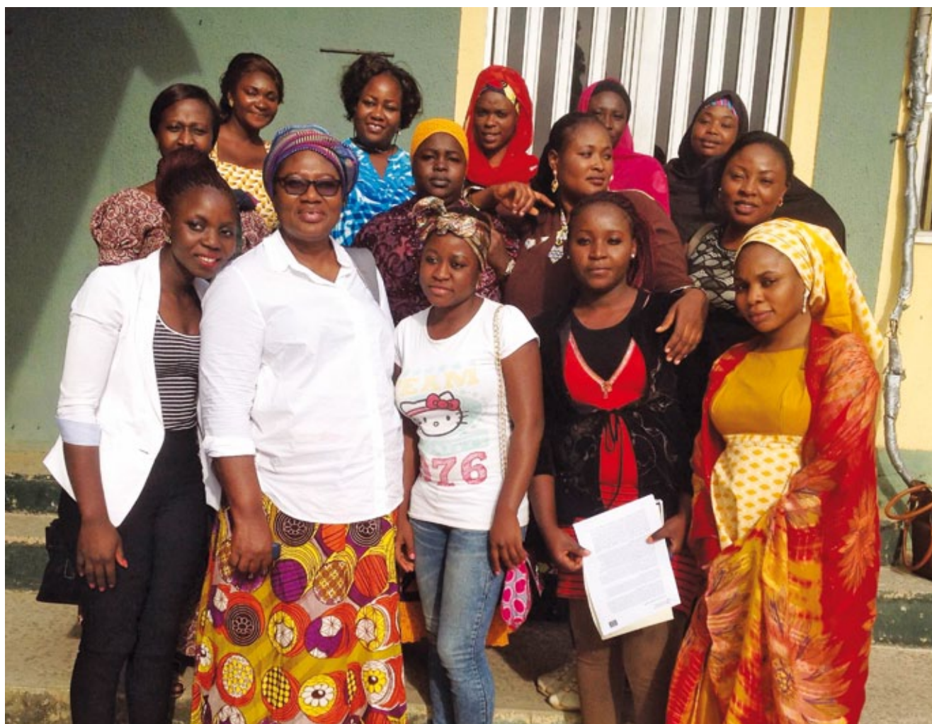
Youth Peace Platform in Plateau State, Nigeria

Additionally, we helped armed conflict parties to be better prepared to engage in non-violent conflict resolution in four contexts. For example, in the Horn of Africa, with our support and advice, the Kenyan facilitation team successfully convened a third round of talks between the Government of Ethiopia and the ONLF. At this first face-to-face negotiation between the two parties since October 2012, the parties reached agreement on a number of issues and set a date for the next round of talks. In Colombia, the Government and FARC, who are currently in peace negotiations, separately welcomed Conciliation Resources' insights and lessons from the process of Disarmament, Demobilisation and Reintegration in Mindanao, the Philippines.