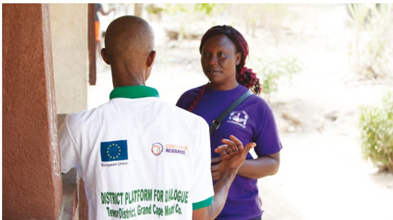
District Platform for Dialogue member in discussions with IREDD staff, Mano River Region, West Africa.

In Colombia, the Caucasus and East and Central Africa, we addressed the legacies of violence in conflict-affected societies through activities which focused on 'dealing with the past' and reconciling communities. In the Caucasus, relationships were consolidated among a network of individuals from across the Georgian-Abkhaz divide, working to compile an archive about the war in two parallel collections. Providing new oral history accounts, they see their work as going to the core of what happened, and the lessons that need to be learned for the future: "We can't talk about the future without talking about aspects of the past during the war. Now I understand we are gathering human histories that give a mosaic of the truth." In the Nagorny Karabakh context, Armenian and Azerbaijani teams worked to finalise a series of documentary films about the war. The films draw on original interview footage of key actors, telling the story of what happened from different perspectives. The fact that the relationships among participants have sustained through a period of escalating violence, enabling them to work together on such sensitive material, is testimony to their long-term commitment to peacebuilding.