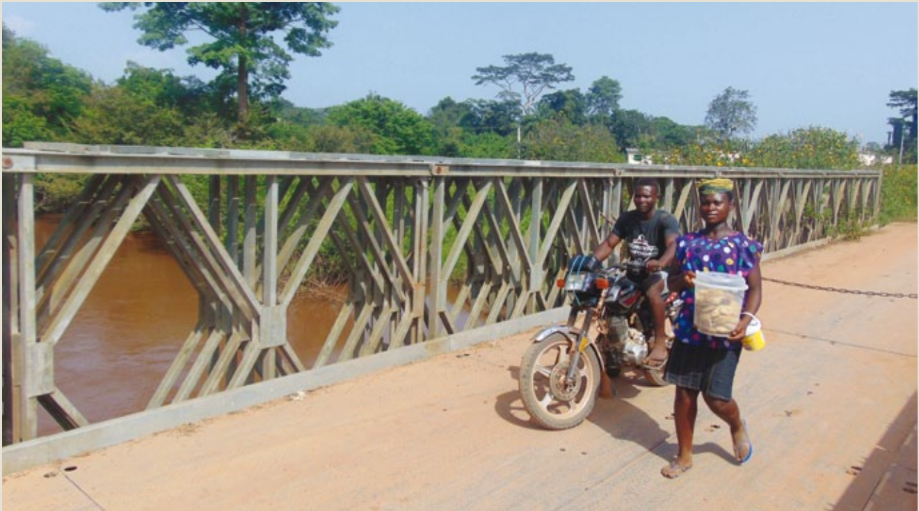
Ivorian-Liberian border crossing (Loguato-Danané), November 2015.

Our work in West Africa led to a greater recognition at policy level of the need for and value of locally owned, non-violent and long-term conflict prevention and peacebuilding initiatives. This was particularly well demonstrated through the signing of the Accra Declaration in October 2015, by government officials and NGO representatives from Côte d'Ivoire and Liberia. The landmark agreement, which was launched in November, signalled a prioritisation of peacebuilding approaches and a new cooperation between the two countries.