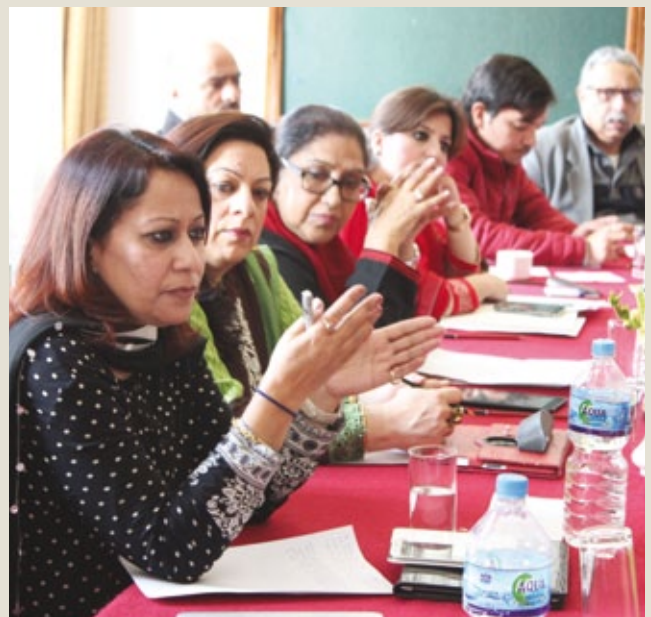
South Asia partners meet to discuss their work