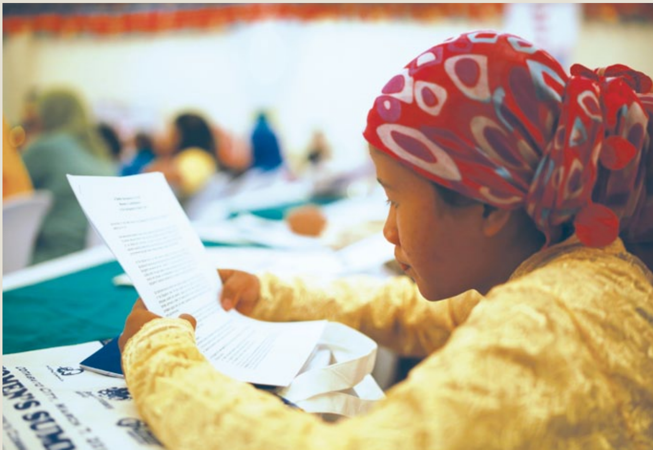
Indigenous woman at the Bangsamoro Women's Summit, Catabato City, Mindanao, March 2014

In 2015, our work in the Philippines continued to ensure greater access and representation for marginalised groups in peace processes and peacebuilding initiatives . Working with different constituencies, we strengthened the participation of a wide variety of women in the implementation of the Mindanao peace process in a number of ways.