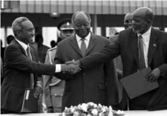
Ali Osman Taha (L) and John Garang (R) with Kenyan President Mwai Kibaki, June 2004.

A summary of major Sudanese peace processes and agreements: does not include procedural agreements or ceasefires, people-to-people reconciliation processes or factional talks. Hosts and dates are shown in brackets.