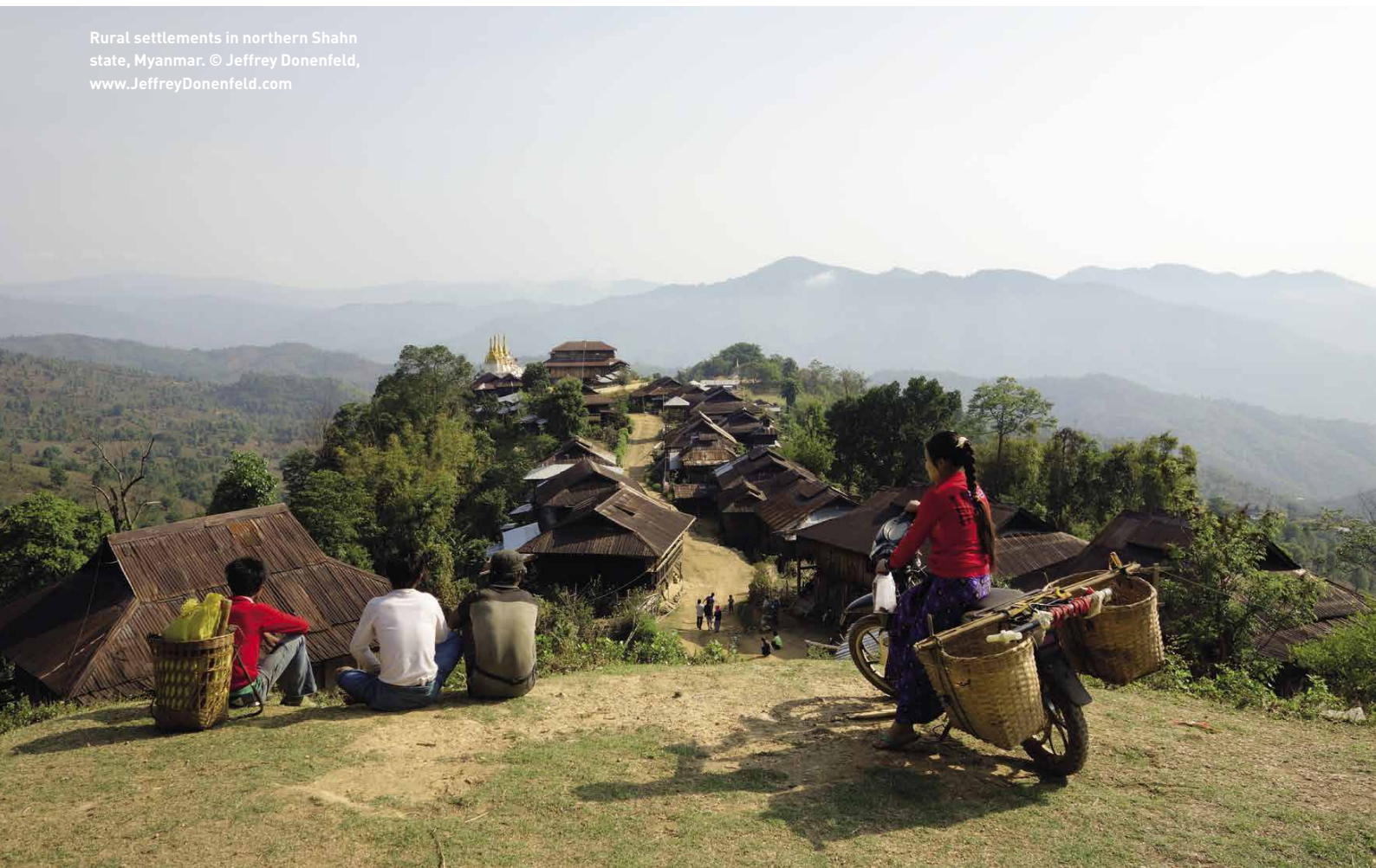
Rural settlements in northern Shan state, Myanmar.

Centre-periphery tensions in northern Myanmar, and their impact on the peace process, have been further complicated by diverse cross-border influences from neighbouring China. China's decision in the 1980s to decrease its support for ethnic armed groups and strengthen government-to-government relations was instrumental in shaping the military government's ceasefire strategy. Weapons sales, protection in UN Security Council debates, and increased investment and border trade from China were all important in strengthening Myanmar's military government throughout the 1990s and 2000s. Stabilising Myanmar government control over the country's borderlands has also been viewed by some within China as a way to address security threats, especially the cross-border flow of drugs, and to provide a more secure environment for Chinese trade and investment. For business and political elites in Yunnan especially, cross-border trade and investment was viewed as an essential component of the province's development strategy.