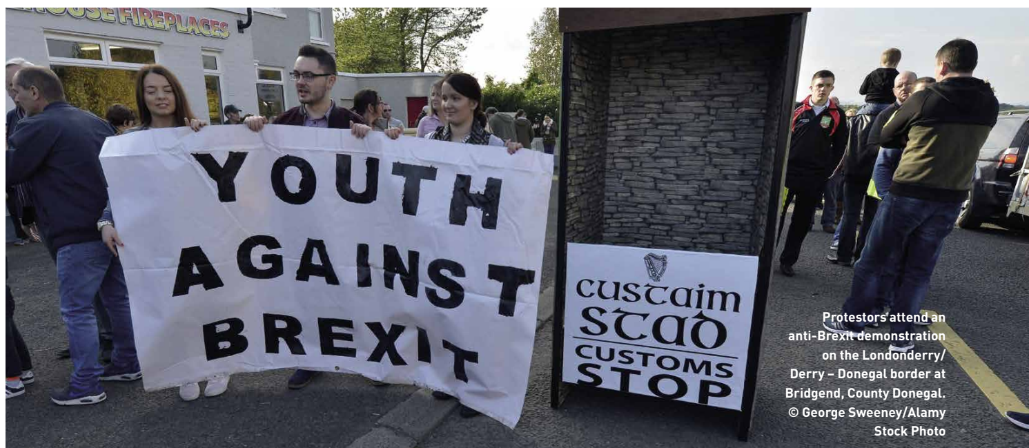
Protestors attend an anti-Brexit demonstration on the Londonderry/Derry – Donegal border at Bridgend, County Donegal.

the centralised nature of governance and administration in Ireland and Northern Ireland, it is clear that local cross-border cooperation has continually had to work against the flow.